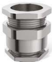
A1/A2 Type Cable Glands