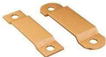
Copper Tape Clips