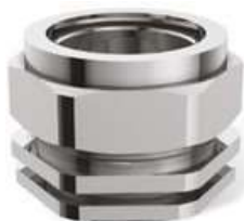
BW Cable Gland