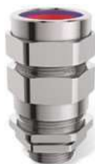
E1W Cable Gland